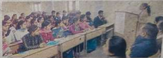
हरौली : हरौली कालेज में आयोजित कार्यक्रम के दौरान स्टाफ सदस्यों संग विद्यार्थी सामूहिक चित्र में।